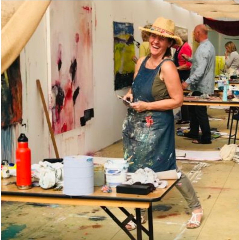
Gareth Edwards - Abstract Expressionist Landscape | 5 day course | September